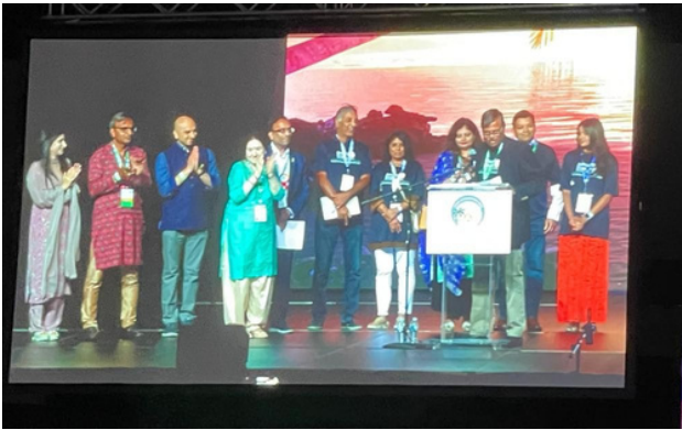
Akshaya Patra at JAINA 2023

The Akshaya Patra Foundation had the privilege of hosting a booth at NATA 2023 in Dallas (North American Telugu Association) - a prestigious event that brings together the vibrant Telugu community from all over North America.